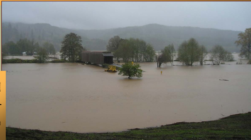
Grays R. Covered Bridge after Nov 06 Storm